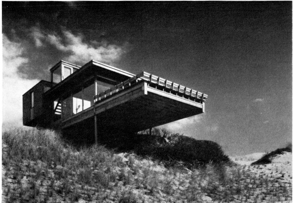
ARCHITECT: Edward F. Knowles LOCATION: Fire Island, New York SIZE: 1,713 square feet, main house 772 square feet, decks