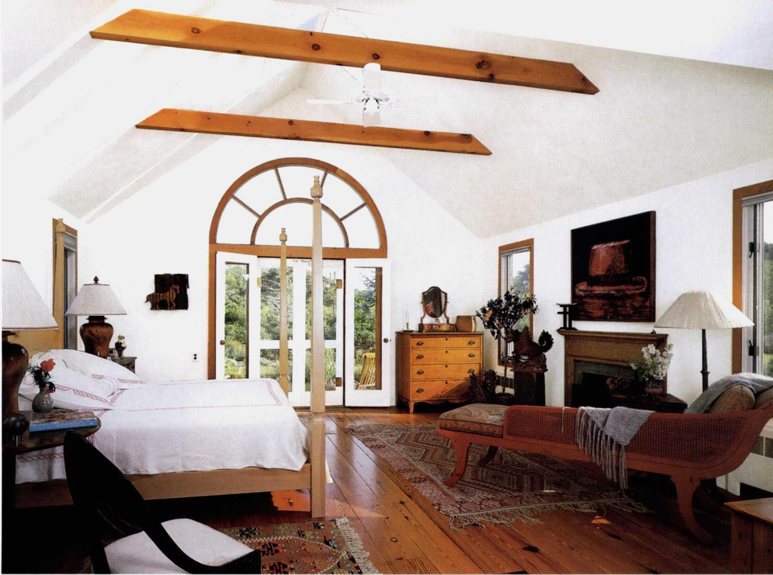
ABOVE: The cranberry bogs are visible through the arched doorway of the master bedroom. Chest is tiger maple; four-poster bed is pine. BELOW: The living/dining room deck has English outdoor furniture. "It's a fine place to feed the fish and take in the sun," says Knowles.

which it follows that the very seclusion of the Robert site, along with its size—seven acres—amounts to an incomparable benefit: The woods and bogs that surround it will presumably remain inviolable forever.