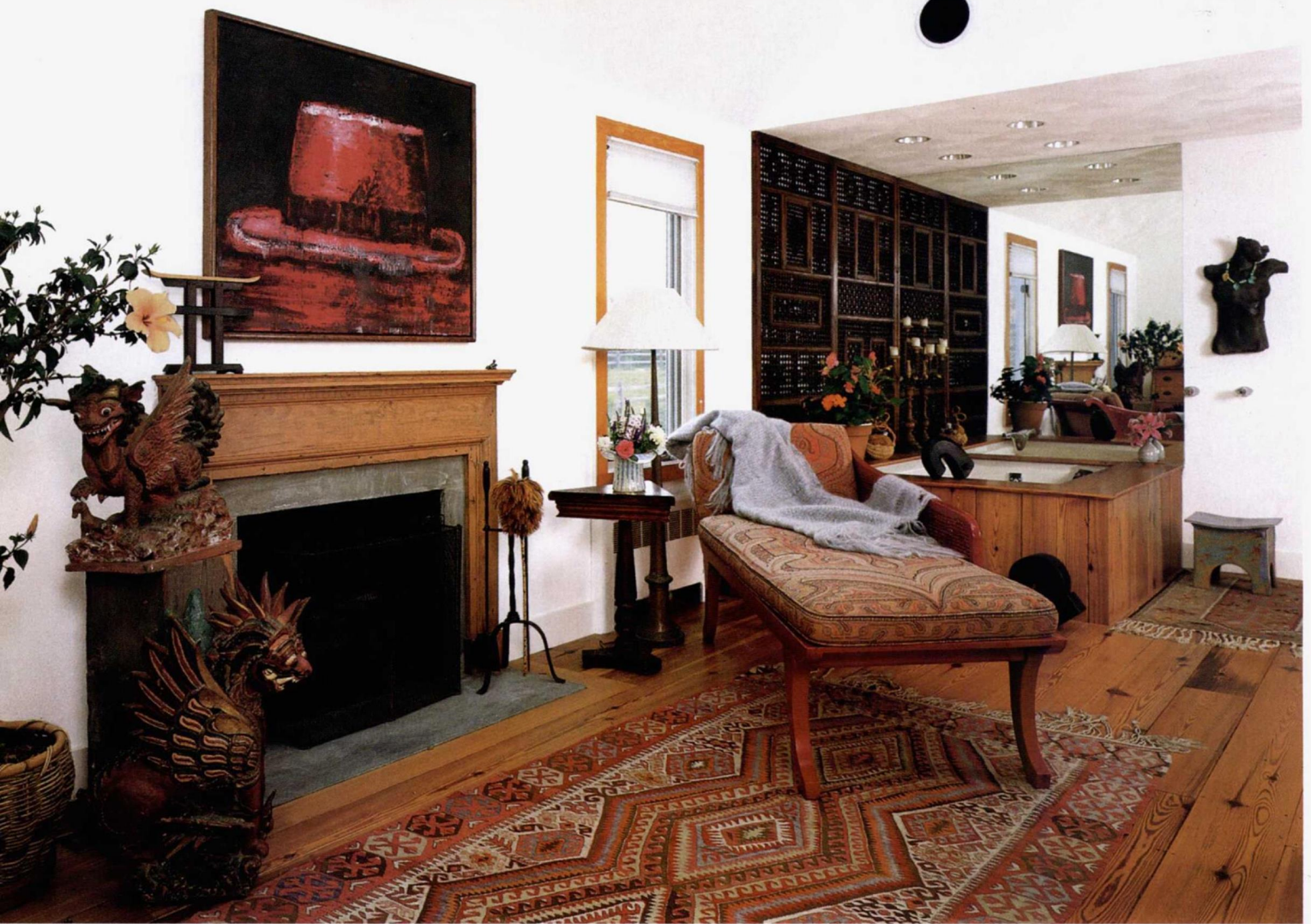
The master bedroom sitting area features a cane-and-red-lacquered-wood chaise longue made in China. A harem screen ornaments a wall above the Jacuzzi. To the left of the antique pine mantel are two carved wooden winged lions from Bali. Painting is by Aaron Fink.

woods in any fairy tale, and arrives at last at an elevated open place, from which one looks out through scattered clumps of trees to a sea of cranberry bogs. The bogs are a landlocked version of the true sea itself, that illimitable Atlantic which hovers unseen upon the horizon.